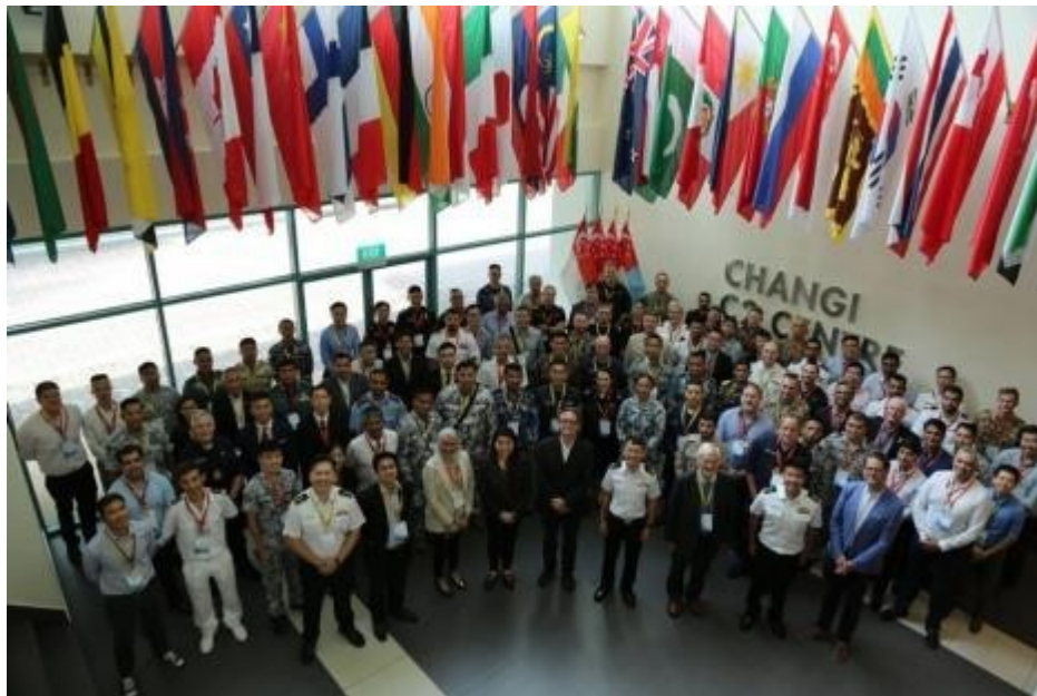
2 - The 10th RMPP was attended by participants from the shipping industry, navies, coastguards and maritime agencies.

Bringing different stakeholders together to discuss MARSEC matters has many benefits. Not only does it clarify any misconceptions about how different parties respond to a MARSEC incident, it also sets expectations based on what the other party can offer. The IFC co-organised the 10th Regional MARSEC Practitioner Programme (RMPP) with the S. Rajaratnam School of International Studies (RSIS) from 5 to 9 Sep 2022, which was physically attended by over 90 participants from 28 countries and for the first time, it involved participants from the shipping industry. The 10th RMPP was designed to promote interaction and build greater understanding between the shipping industry and the MARSEC agencies while enhancing professional knowledge for MARSEC practitioners. The participation of the shipping industry has certainly enriched the perspectives and broadened the scope of discussions.