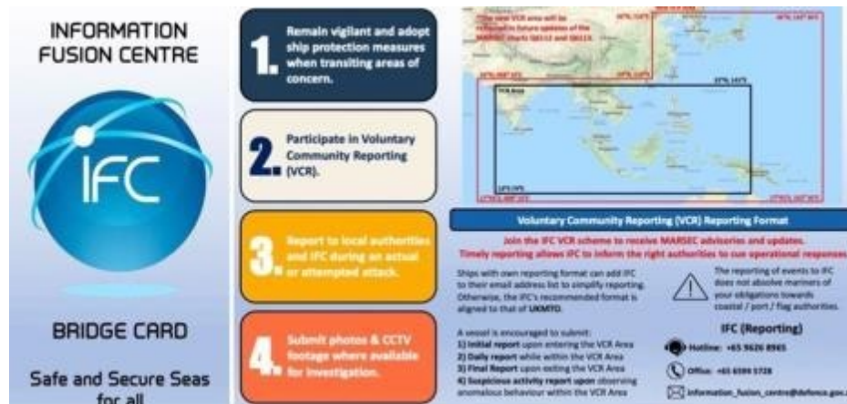
4 - The IFC Bridge Card was launched on 12 May 2022.

or sightings of suspicious activities. The IFC will continue to work together with the shipping industry to understand their needs and concerns and develop products which meet the industry's requirements.