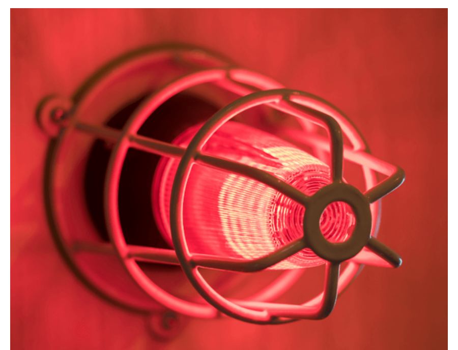
Sound ship's alarm when suspicious small craft(s) sighted.