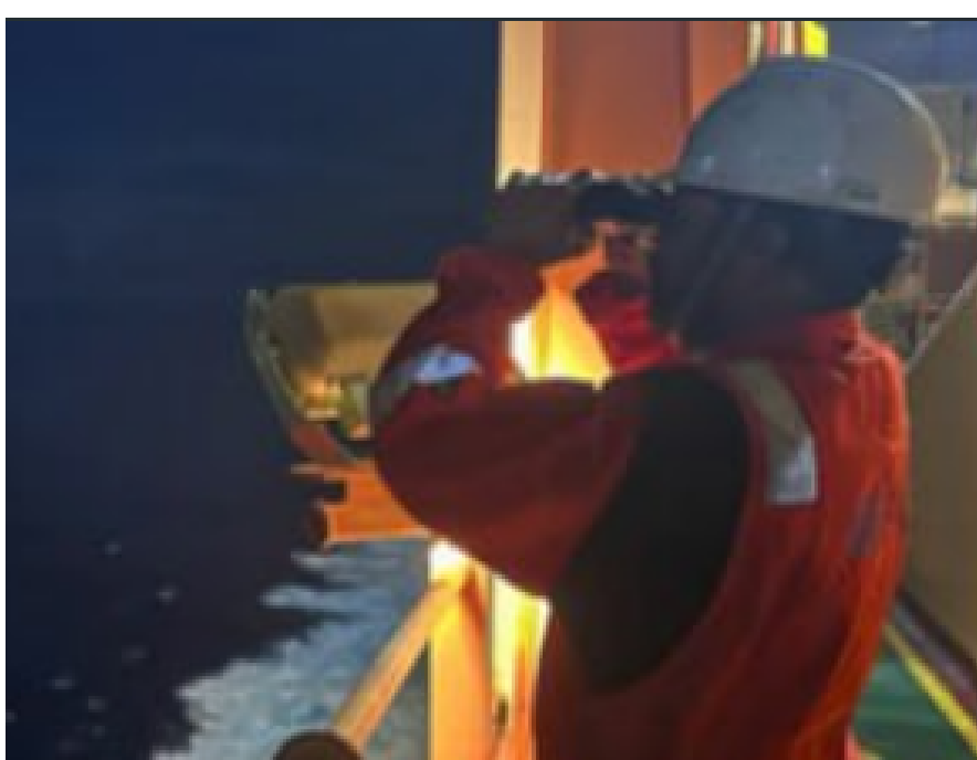
Maintain all-round lookout at elevated position